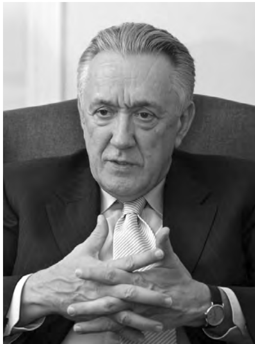
EC COMMISSIONER FOR TAXATION AND CUSTOMS UNION, MR LÁSZLÓ KOVÁCS